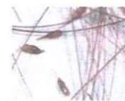
Nits (lice eggs) photo courtesy of the University of Florida.

Female head lice glue their grayish-white to brown eggs (nits) securely to hair shafts. The eggs are resistant to pesticides, and they are difficult to remove without a special 'nit-comb.' The nits are generally near the scalp, but they may be found anywhere on the hair shaft.