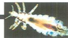
Head louse Pediculus capitis

Head lice are small, wingless parasitic insects. They are typically 1/6 - 1/8 inch long, brownish in color with darker margins. The claws on the end of each of their six legs are well adapted to grasping a hair strand.